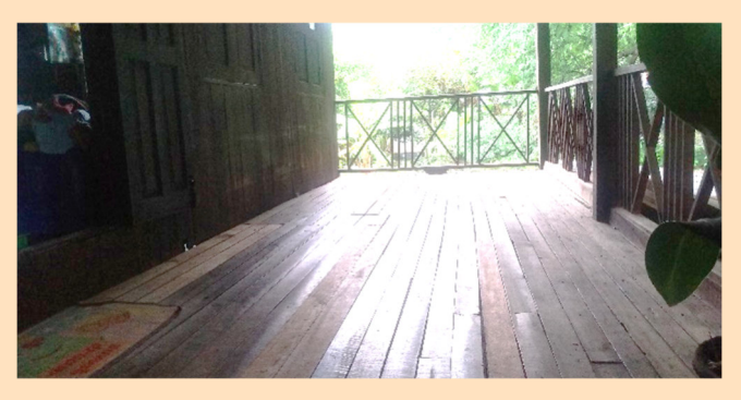
Maintenance job 4: Part of the renewed wooden floor in the girls' house