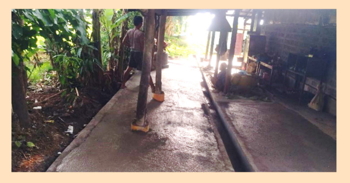
Maintenance job 2: The renewed concrete floor in the kitchen of the girls' house