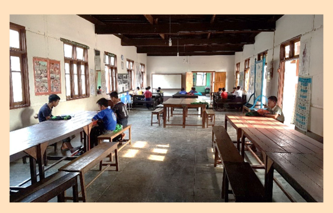
When the children go to the government school, they wear a school uniform. This is common practice in all schools in Myan-

The boys' house is within walking distance of the girls' house. Both houses are very similar in construction. The building has a number of large areas where the boys can study, recreate and watch television.