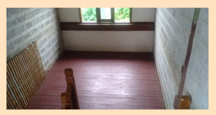
Maintenance job 3: Part of the renewed wooden floor in the boys' house